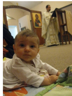
11: Sunday Homilies