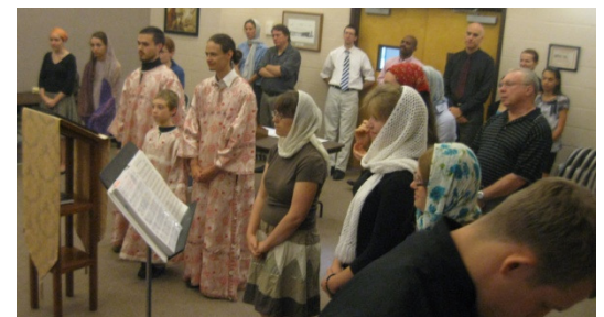
4: Divine Liturgy on Sunday