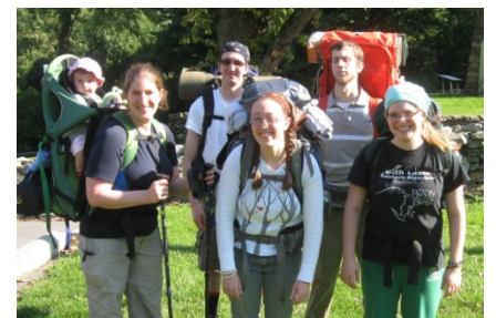
10: Brave backpackers starting out on the trail