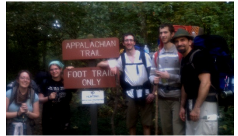
1: Fall Backpacking Retreat

The students choose to come to worship on Saturdays instead of partying, showing the difference that this ministry is making in their lives. Our Saturday Vigil service at the Mission is largely attended by the