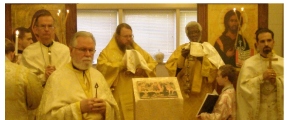
3: Divine Liturgy at Patronal Feast