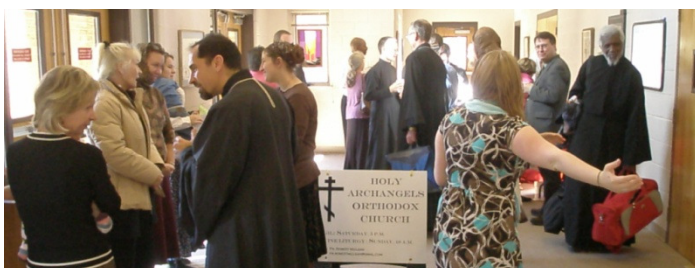
12: Students helping with Patronal Feast