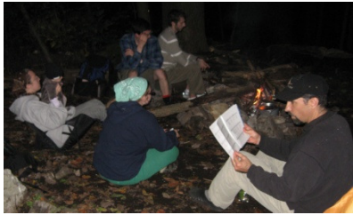
6: Evening around the fire; hymnody of Church

This year for our annual Fall retreat we took in some spectacular Fall weather and went backpacking along the Appalachian Trail. This was a bonding time for our group and a welcome respite in God's creation for all.