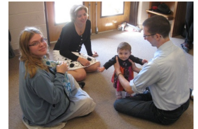
9: Trapeza fellowship on Sunday

Wishing you every blessing as we look to the celebration of the holy Incarnation and Nativity of our Lord God and Savior Jesus Christ,